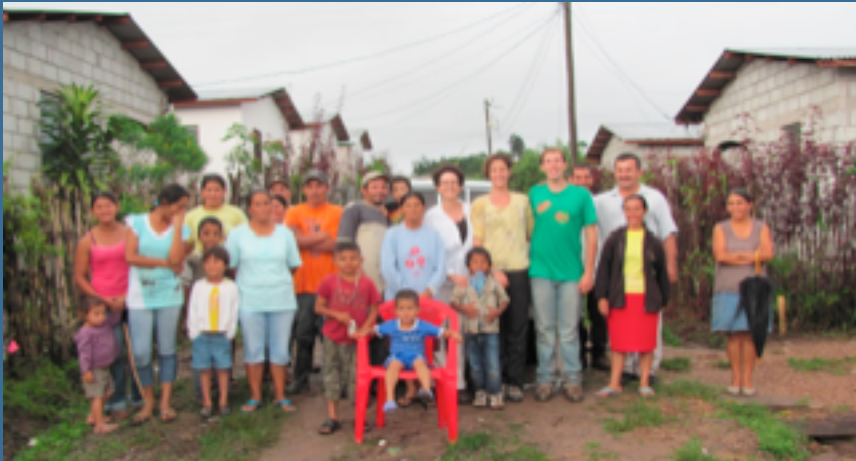
EWB-UM students and mentors along with several Dulce Vivir community members on the assessment trip taken in August 2010.